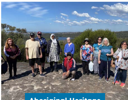
Aboriginal Heritage Walking Tour Manly Dam