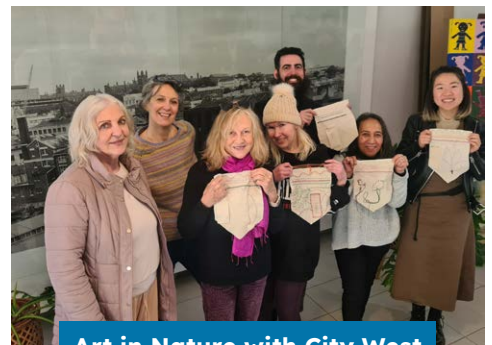
Art in Nature with City West and City of Sydney

We acknowledge Aboriginal people as the traditional owners of the land, and pay our respects to elders past and present. Always was. Always will be. Aboriginal Land.