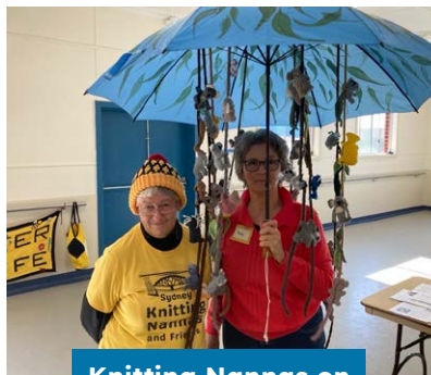
Knitting Nannas on the Northern Beaches