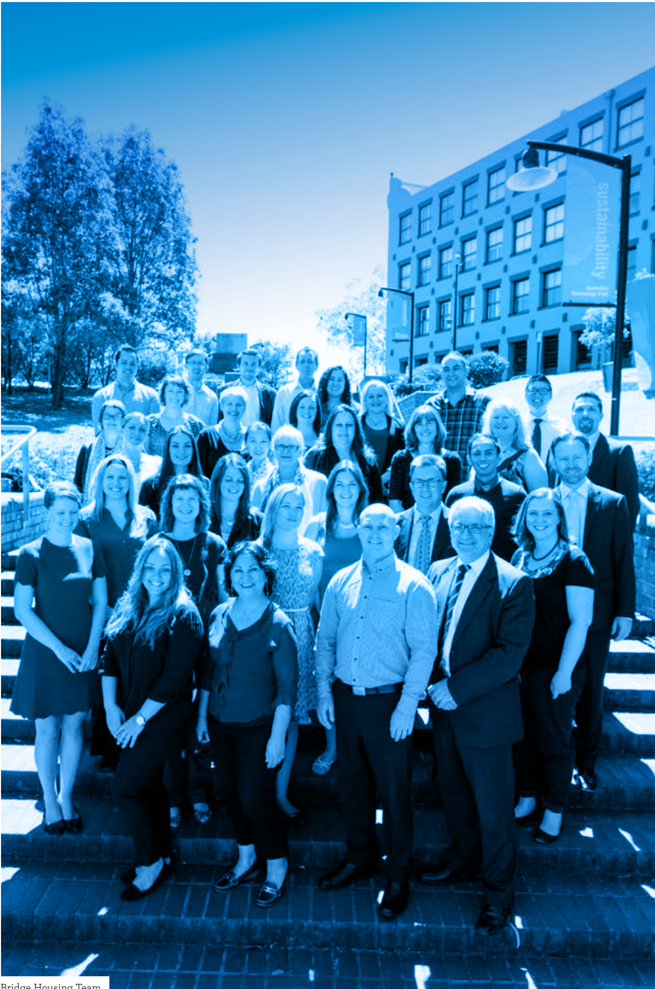
Bridge Housing Team