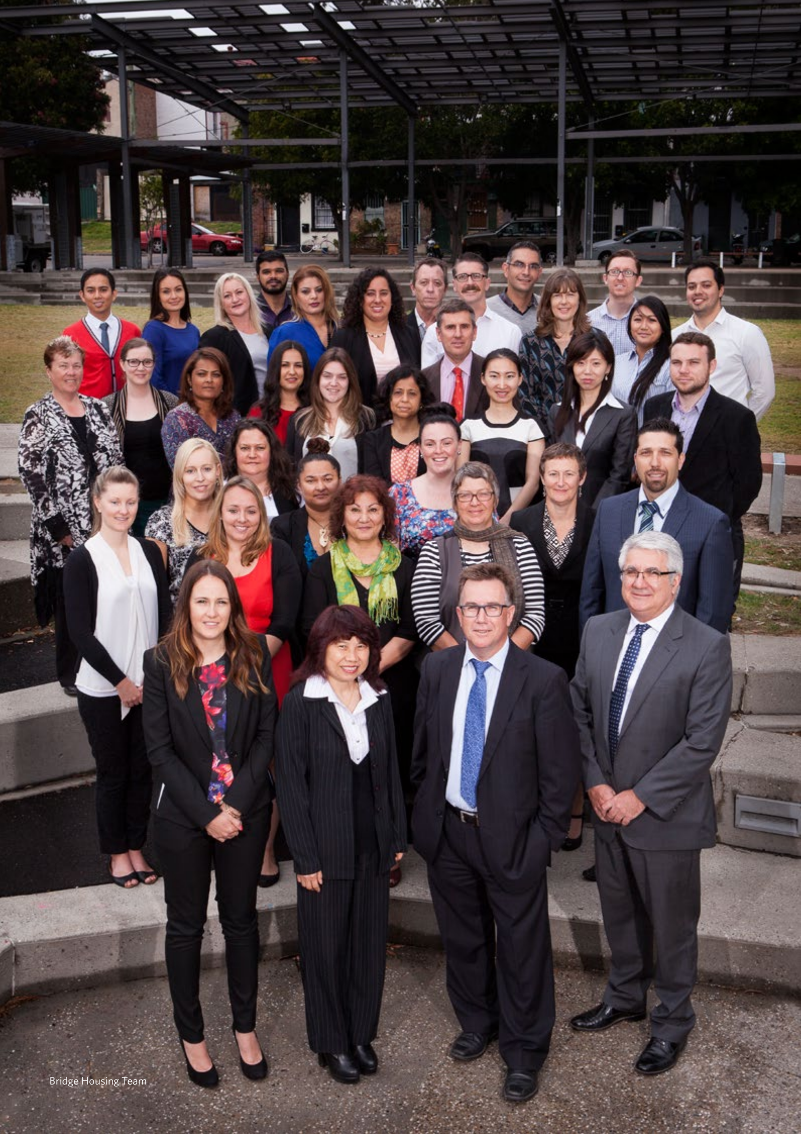
Bridge Housing Team