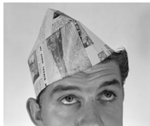
Railway Commissioners