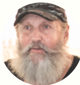
Building 3 & Art Club Ray