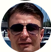
Building 1 Nick